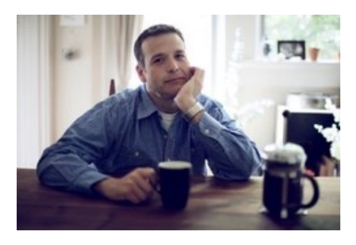
How exciting is your life?

If your life were made into a movie, would the audience stay riveted to every scene?