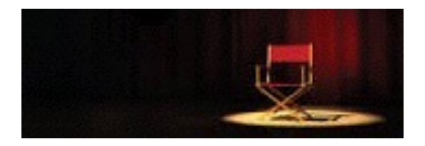
What script will you accept?

Now that you have the new story outlined, you may find that the external world will come to you with scripts based on the old roles. You had become so good at them! Before you accept the script, consider if you want the world to know you as a character actor that is only qualified to play the old roles. Or, are you willing to put in the time and effort to build your fame as a new hero actor, accomplished, inspiring and content?