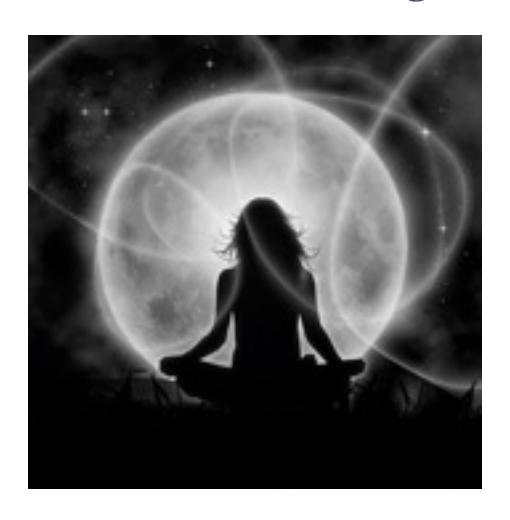
Who wrote this?

We expect our life or others in our life to add meaningful, to fill our emptiness, to give us purpose while we continue to live our day to day, ordinary experiences. What is the old saying? Oh yes, "The definition of insanity is doing the same thing over and over again expecting different results."