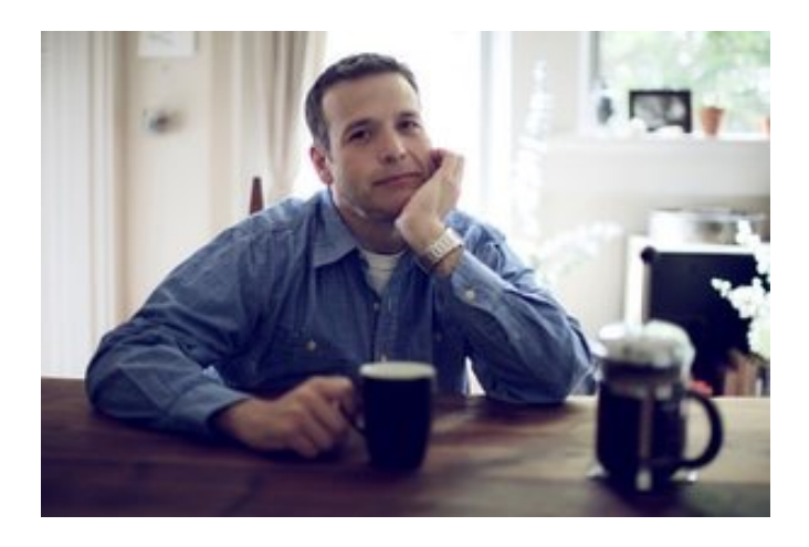
How exciting is your life?

If your life were made into a movie, would the audience stay riveted to every scene?