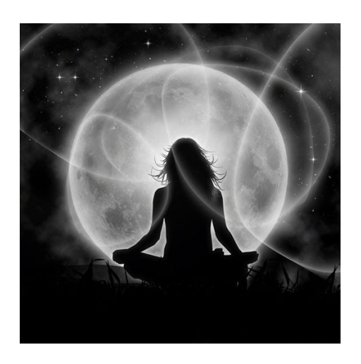
Who wrote this?

We expect our life or others in our life to add meaningful, to fill our emptiness, to give us purpose while we continue to live our day to day, ordinary experiences. What is the old saying? Oh yes, "The definition of insanity is doing the same thing over and over again expecting different results."